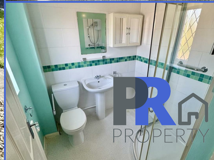
19 Mees Close, Luton, LU3 4AZ £1,500